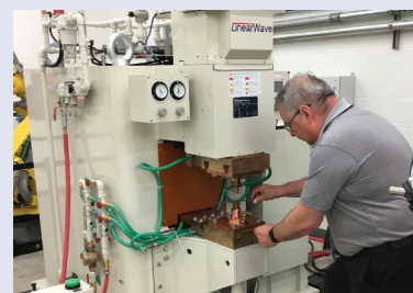
Ring projection weld test on LinearWave