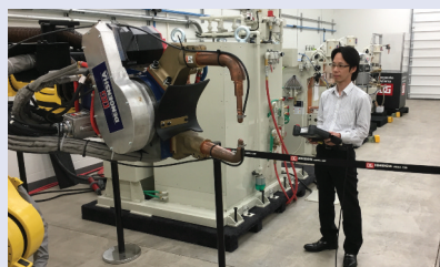
Reduction Gear X-Gun mounted on FANUC Robot