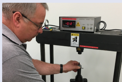
Push-out test to confirm weld strength