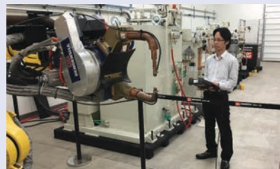
Reduction Gear X-Gun mounted on FANUC Robot