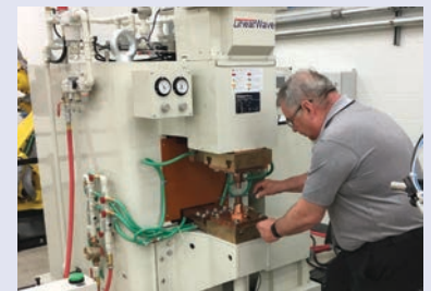
Ring projection weld test on LinearWave