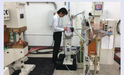
New Magnetic Rotary Nut Feeder

www.dengensha.com Email: sales@dengensha.com