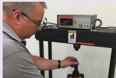
Push-out test to confirm weld strength